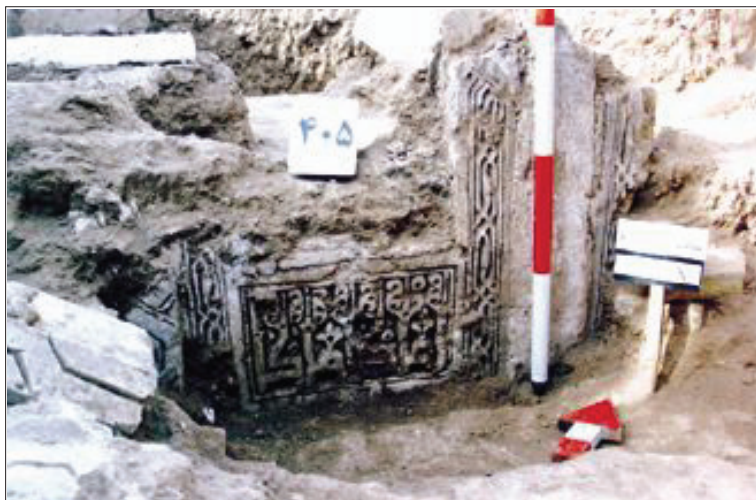
Fig. 5- The plasterwork found in the southern gate of Shadyakh. ( http://www.iran-newspaper.com/1384/840130/html/iran.htm )