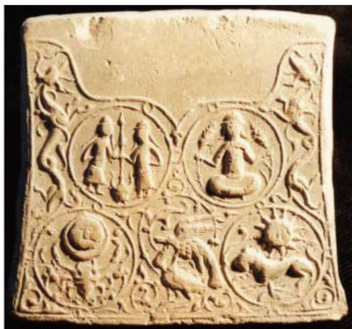
Fig. 3- An earthenware inscription with images of humans and animals unearthed in the ruins of Shadyakh ( http://iranmiras.ir/Arch_report/shadiakh/ )