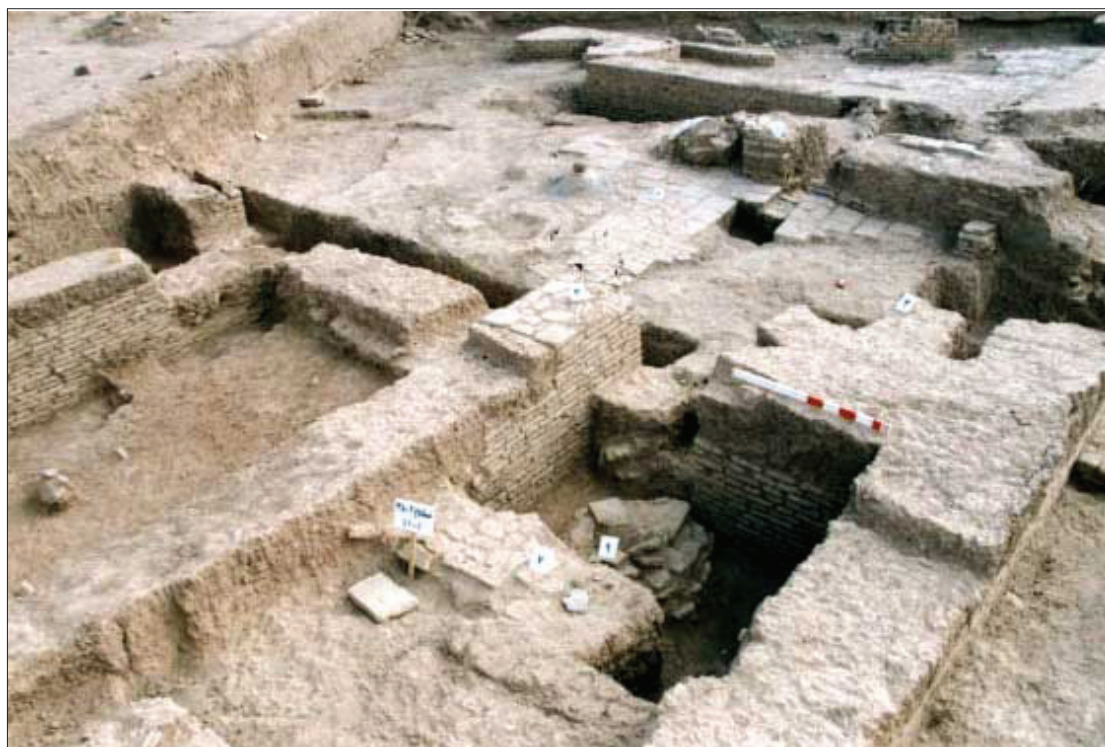
Fig. 2- A view of the buried city of Shadyakh discovered during the recent explorations.